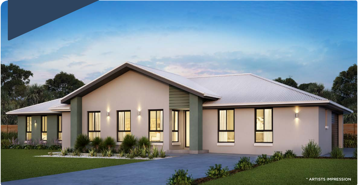
* ARTISTS IMPRESSION