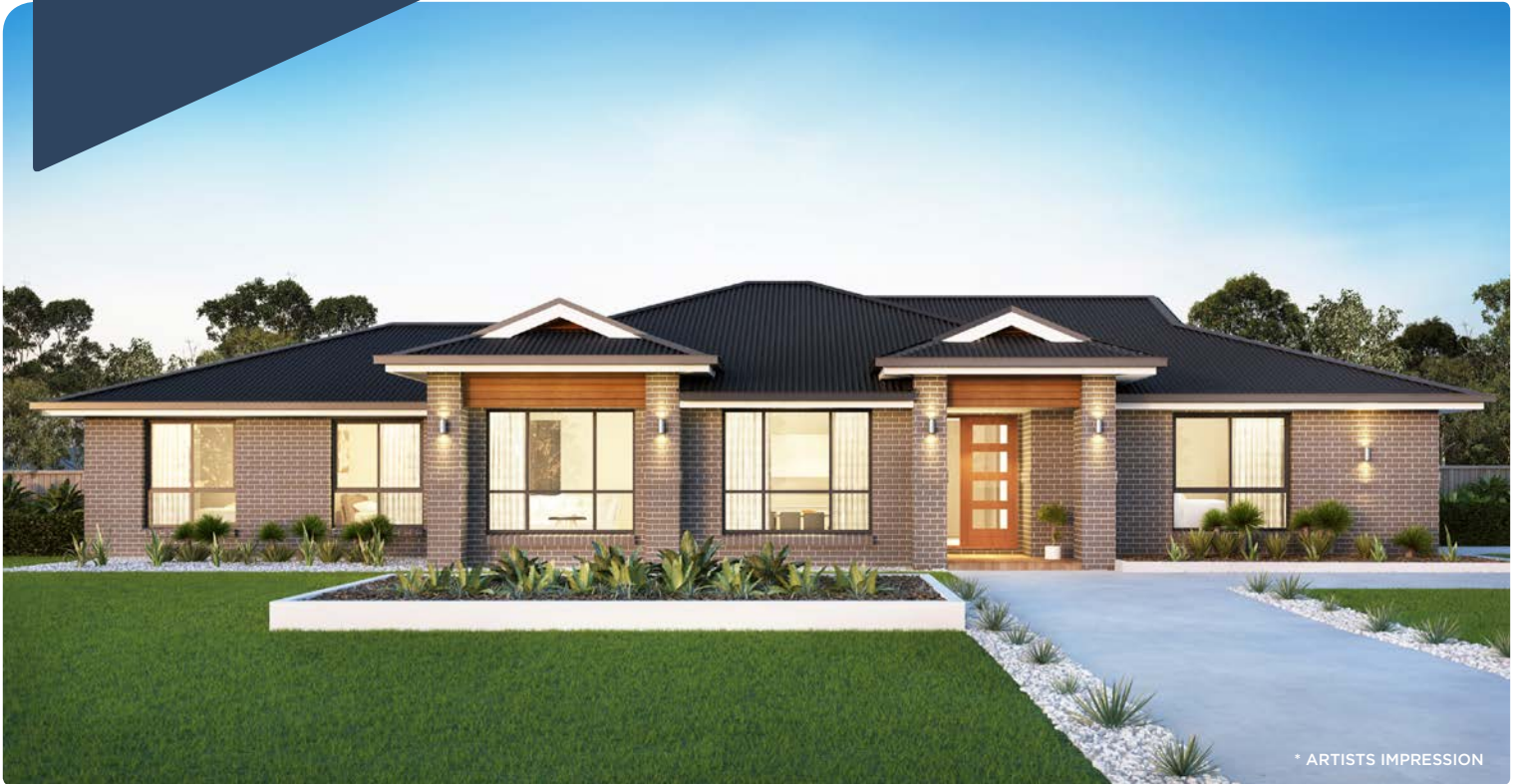
* ARTISTS IMPRESSION