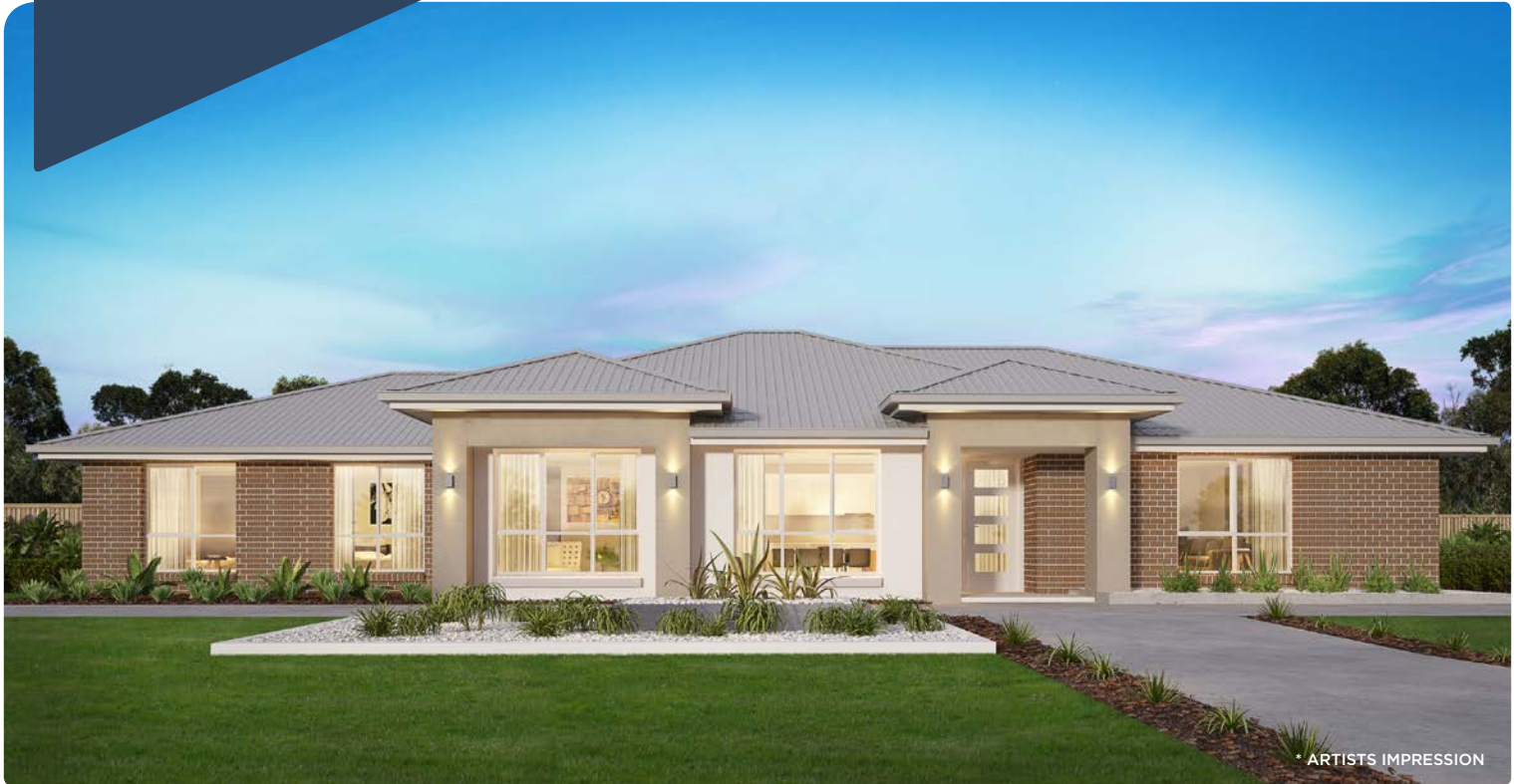
* ARTISTS IMPRESSION